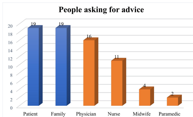
Figure 1 Categories of people who turn to chaplains for ethical advice in making difficult medical decision.

cancer treatment and another—limb amputation. Within the above categories, the questions most often asked of hospital chaplains concerned methods of birth control, discontinuation of persistent therapy and donating organs for transplantation—with 9%, 8% and 8% of chaplains, respectively, admitting that they encountered such questions several times a year (figure 2).